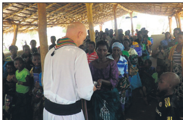
Parishioners from Chimuto, Mozambique receive the Eucharist.