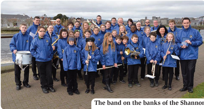
The band on the banks of the Shannon