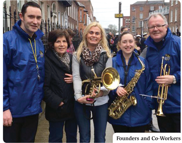
Founders and Co-Workers

Discover more about the Redemptorist Centre of Music at www.redscentrefmusic.ie or find them on Facebook!