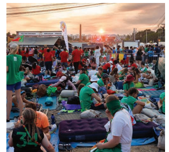
WORLD YOUTH DAY LISBON 2023